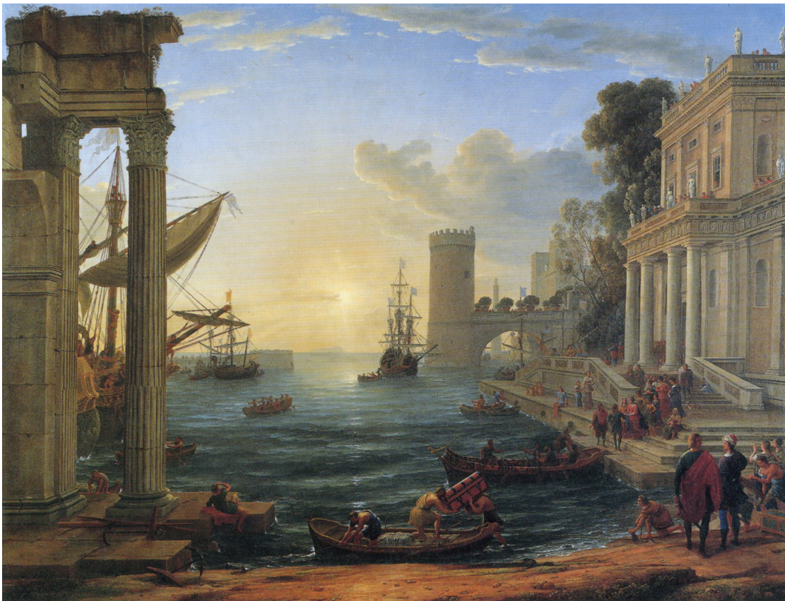
Claude Lorrain, title TK, date TK

As I was making the photograph at Beverly and La Brea, as I was figuring out where precisely to position my camera to make sense of all of the visual relationships I was trying to coordinate, I realized that while I was grappling with the visual facts in front of me, I was imposing a truly classical pictorial organization. It seemed to me reminiscent of a landscape by Claude Lorrain (whose life overlapped Kepler's), with one-point perspective and vertical objects near the sides to give tension to the edges and activate the illusion of space.