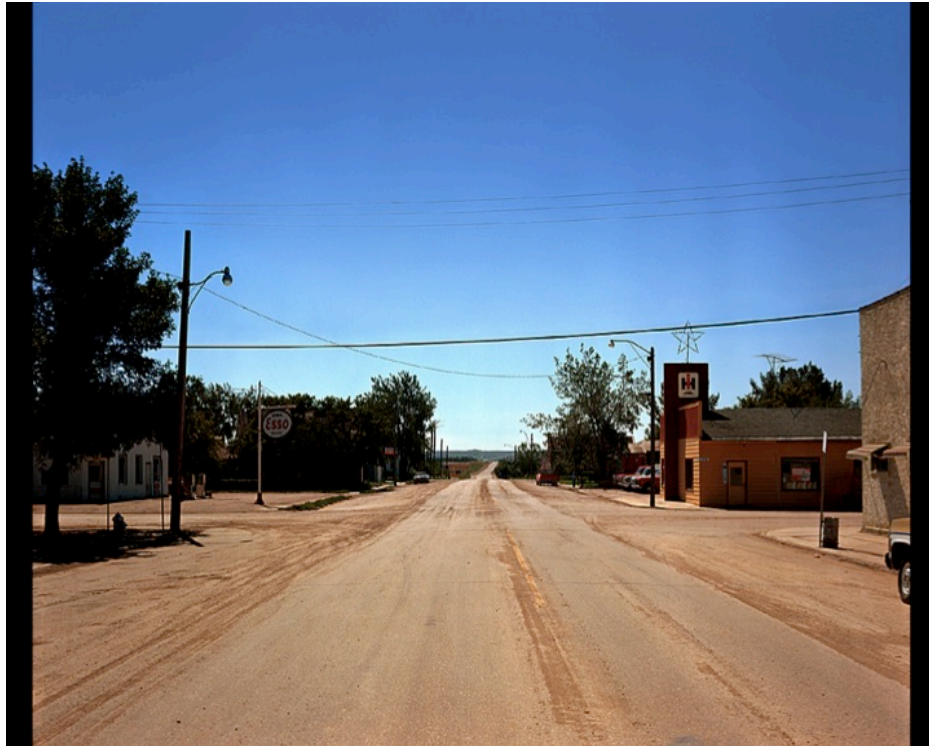
Proton Avenue, Gull Lake, Saskatchewan 1974

For about a year, my work had been moving toward greater structural complexity. Look at this picture made a year before the Los Angeles image: