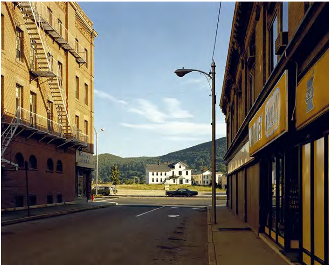
Holden Street, North Adams, Massachusetts, July 13, 1974, 1974

AS The reason I first got into it is that I was working my way making pictures through my twenties, and I thought, why is it all these photographers – and very different kinds of photographers, you and Sally Mann couldn't be more different – use the view camera? Why was I attracted to something about these pictures? Even without seeing it in real life, I can feel this quality. So I tried it, and it's like magic. There's the detail and all that stuff, and now digital cameras have much more detail. But it's the rendering of space for me. The way that 300mm lens deals with space is incredible. It's just so palpable.