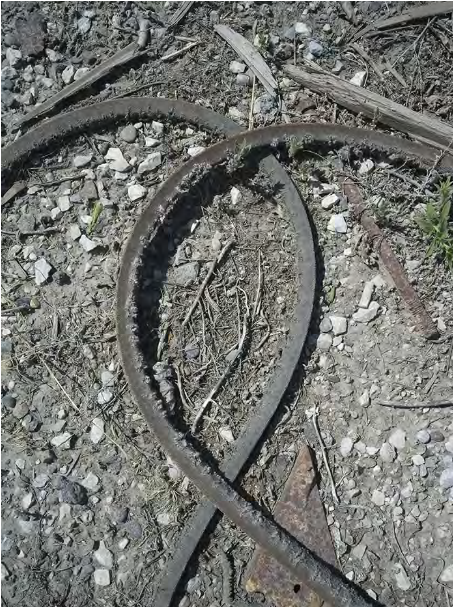
Three Forks, Montana, August 6, 2017, 2017