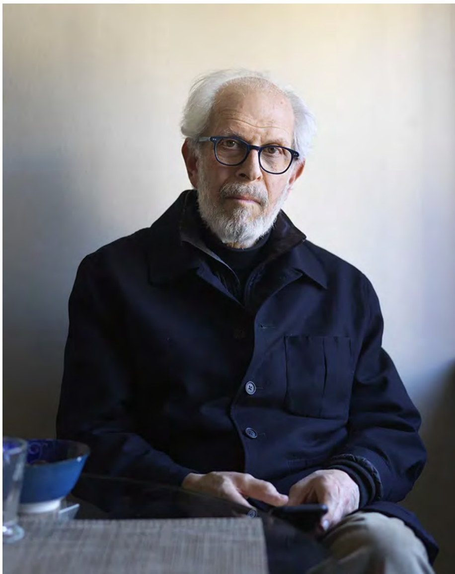
Stephen Shore

This year's Photo London's Master of Photography talks to fellow US artist Alec Soth (who also takes his portrait)