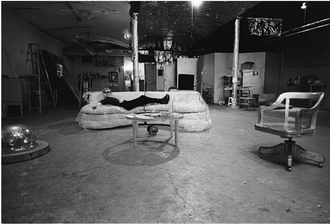
Andy Warhol, the Factory, New York, New York, 1965