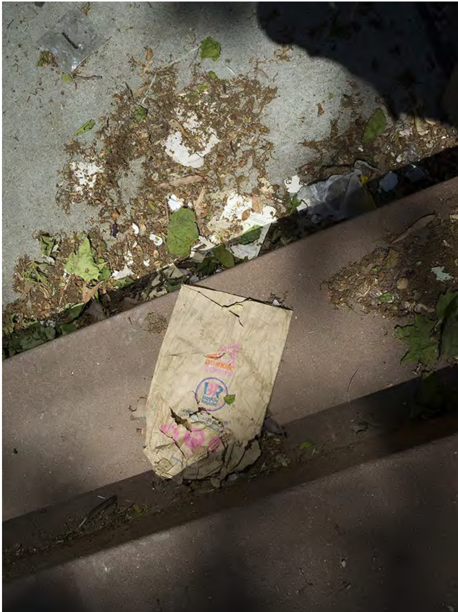
New York, New York, May 19, 2017, 2017 © Stephen Shore, courtesy 303 Gallery, New York

With Instagram, I'd probably spent too much time photographing just stupid stuff on the ground. I have these two little dogs I walk every day, so I'm often looking down. The X1D is a lot more cumbersome than a phone but because it's touchscreen, I feel like I can almost take the same pictures I'm doing with my phone. So, I was doing these pictures with the X1D and blowing them up huge, and the quality is amazing. That was my last gallery show and I'm still working on it.