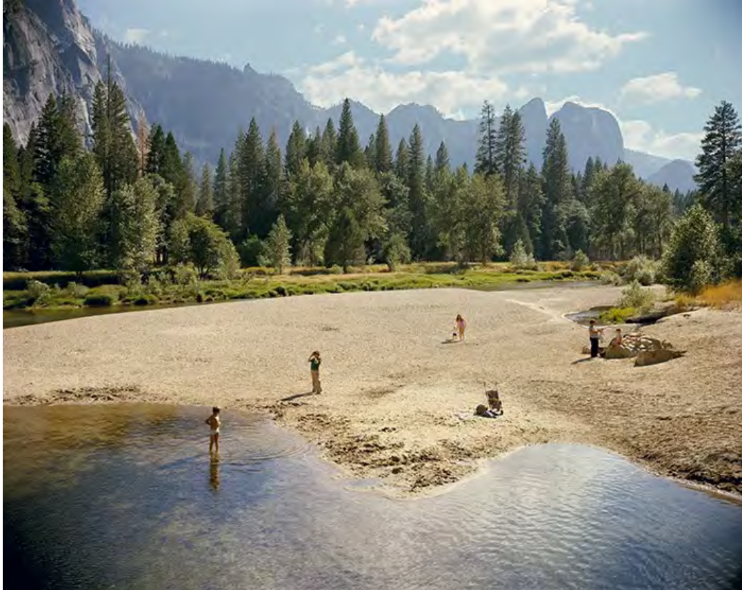
Merced River, Yosemite National Park, California, August 13, 1979

AS I've used fishing as this analogy for photography for a long time, because photography, like fishing, is this super-accessible hobby. For most people, it functions as a hobby. And if you're a fisherperson and you decide "I want to be a professional fisherperson," that's so stupid.