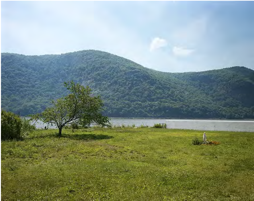
Putnam County, New York, 1985, 1985

SS Yes. I would do trips, but they were much shorter. I wasn't going away for two or three months; I was going away for a couple of weeks. Although, thinking about it, my son was born in '88. So I started doing landscapes in the '80s and I did three trips to Texas where I'd go away for a few weeks, and sometimes my wife would come with me. Then, after my son was born, I did one trip to Scotland and he was six months old and he came along. My wife, being a good sport, took care of him all day and I went out and took pictures. But I was never going to do it again. Just being married meant I wasn't going to go away for three months again.