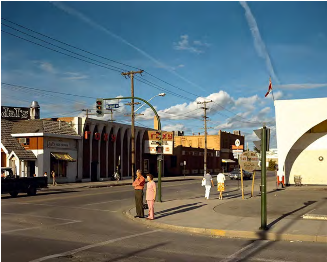
Broad Street, Regina, Saskatchewan, August 17, 1974, 1974