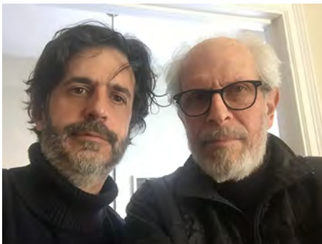
Alec Soth and Stephen Shore

AS All right. I can now officially turn this off.