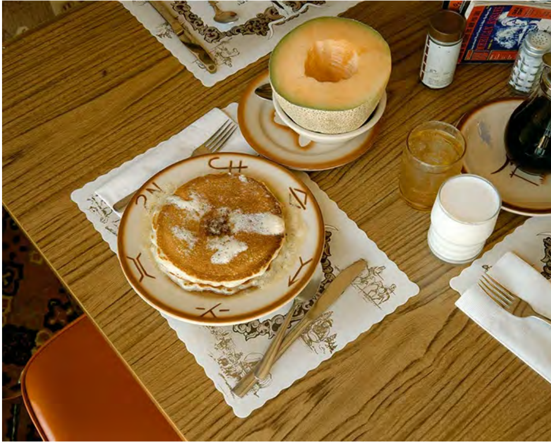
Breakfast, Trail's End Restaurant, Kanab, Utah, August 10, 1973, 1973 © Stephen Shore

SS Yes, and the formalism you talked about. But I want to say something else. By the end of the '70s, I had started taking pictures intentionally that were as simple as American Surfaces . So I feel it's sort of like a spiral, that I start here and go deep into formal complexity and then come out of it to a similar point, but at a different level.