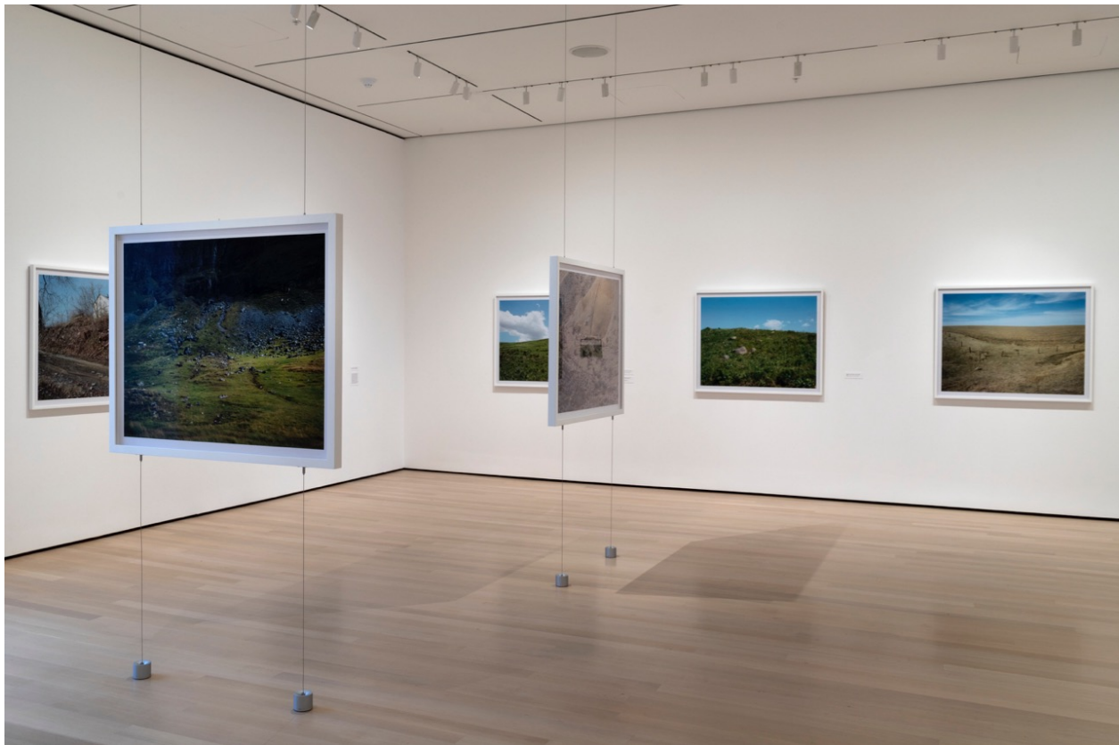
Stephen Shore , installation view.

Unmade beds, Warhol's Factory, the open road: the Museum of Modern Art hosts a retrospective of the prolific photographer.