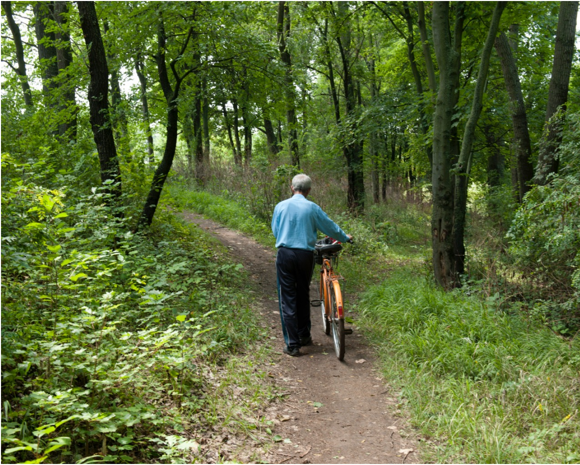
Stephen Shore, Uman, Cherkaska Province, Ukraine, July 22, 2012 , 2012. Chromogenic color print, printed 2017, 16 × 20 inches. © 2017 Stephen Shore. Image courtesy 303 Gallery.

In a recent series, also published as the book Survivors in Ukraine , Shore's experiment was to focus on the human body. His grandfather had emigrated from Ukraine to New York in the late nineteenth century. While that might seem a reason for why the photographs look quite different from his other bodies of work, that is not an explanation for how he achieves or executes that difference; execution is different from intention. In this series, the colors are soft, the picture planes seem fuller as if every centimeter is covered, the pictures have a supple quality. Shore shoots hands, and faces, close up. Books covered with dust, close up. The angles or geometry of spaces are less present.