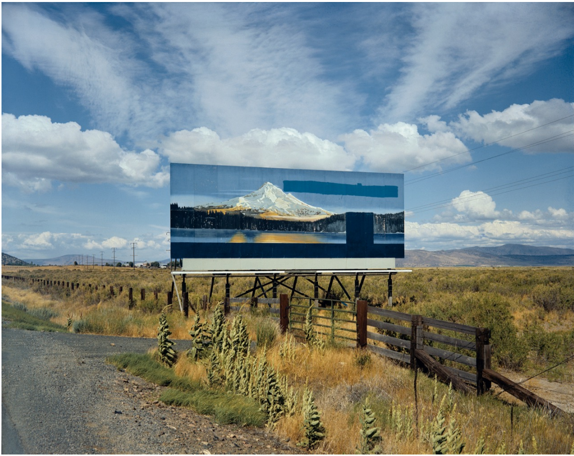
Stephen Shore, U.S. 97, South of Klamath Falls, Oregon, July 21, 1973 , 1973. Chromogenic color print, printed 2002, 17 \frac{3}{4} \times 21 \frac{15}{16} inches.

With his second road series, Uncommon Places (1973–82), Shore studied the architecture of small towns, city streets, random individuals or groups walking or stopped at traffic lights. His rigorous compositions addressed the choreography of movement and stasis, shapes and colors; he noticed visual patterns everywhere. Color relationships, especially, informed his pictures. With this series, Shore changed perceptions about what photographic art is. “Art” had been, primarily, in black and white, but Shore, along with William Eggleston and Joel Meyerowitz, conclusively dismantled that formulation.