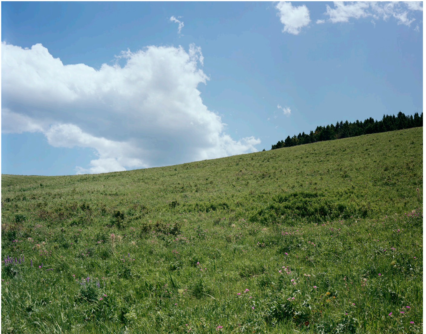
Stephen Shore, Gallatin County, Montana, August 2, 1983.

legacy of the Holocaust, nor any cubit of earth in the state of Israel can be seen apolitically. But Stephen Shore approached these traditionally “concerned” photographic subjects astride and alongside (if not above) political dogma. Discussing a set of his on-demand iPhoto books, where he went out photographing when there were enormous world-shaking events, Shore has said, “On the days in which the Times ran a six-column banner headline I would do a book on that day, that was not necessarily about the event, but it was what was life was like on that day.” Homo visualis sees politics as another arena to be utterly keenly seen, almost without judgment, a tactic which leads to implicit empathy. In Pompeii, you don’t see policy, you see sides of buildings and cobblestone streets. You see what it was like to live there, and so you care.