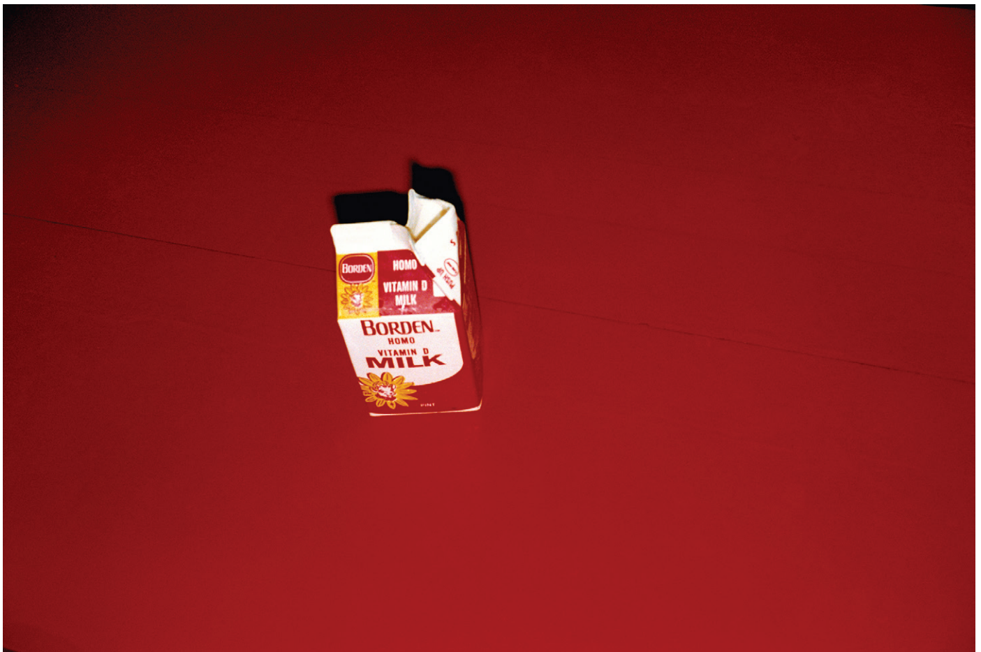
Stephen Shore, Amarillo, Texas, July 1972.

Stephen Shore is, above all, homo visualis. He is a seer, interested in the quantum calculations that accompany the seemingly automatic act of using a camera to translate the three-dimensional world into a flat photograph. I think of this process as the exact opposite of abstraction. A Stephen Shore photograph feels like looking at the world, the translation as precise as possible, a concerted effort NOT to abstract but to simulate or represent the experience of seeing. Shore is almost not making pictures. He is depicting seeing. And unlike almost every other photographer on earth, he is only marginally interested in what he sees. His pictures are largely not of anything. They are experiences, not subjects. When I first met him in the mid 80's, he was making spare, distanced landscapes of Montana, Texas, and Scotland. They almost completely lack content. We look now at his most well known images, from Uncommon Places and American Surfaces , and we see "The 70's." But it wasn't "The 70's" when he made those pictures, it was NOW. Aperture's new, enormous book of this work is being published as far forward from its making, as Shore was then from Walker Evans' American Photographs , and Shore was savvy enough to see Evans' work stripped bare of nostalgia, not as "The Depression," but as Evans' NOW. We need to see Shore's work with the same sober clarity.